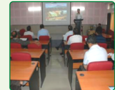
Virtual Class Room