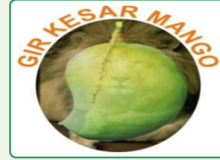
Geographical Indication (GI) for Gir Kesar Mango